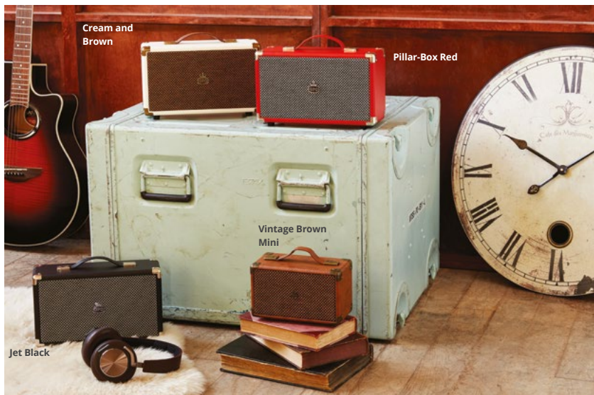
Cream and Brown