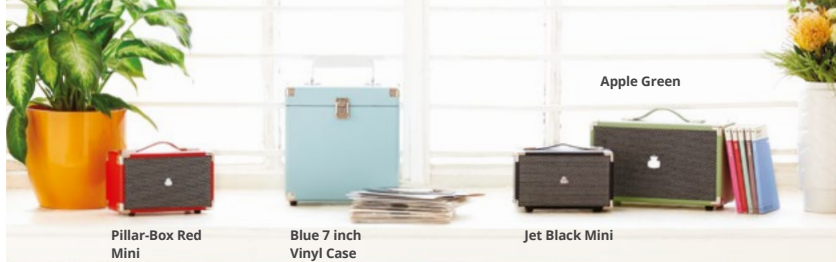
Pillar-Box Red Mini