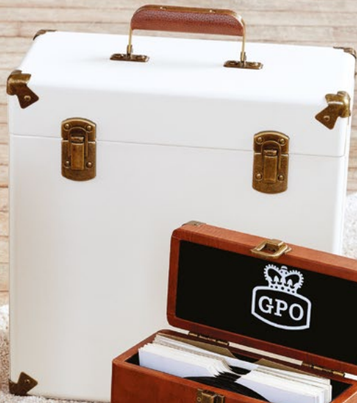
12 inch Cream and Tan