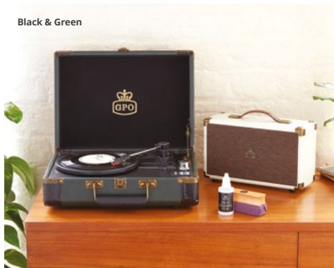
Black & Green