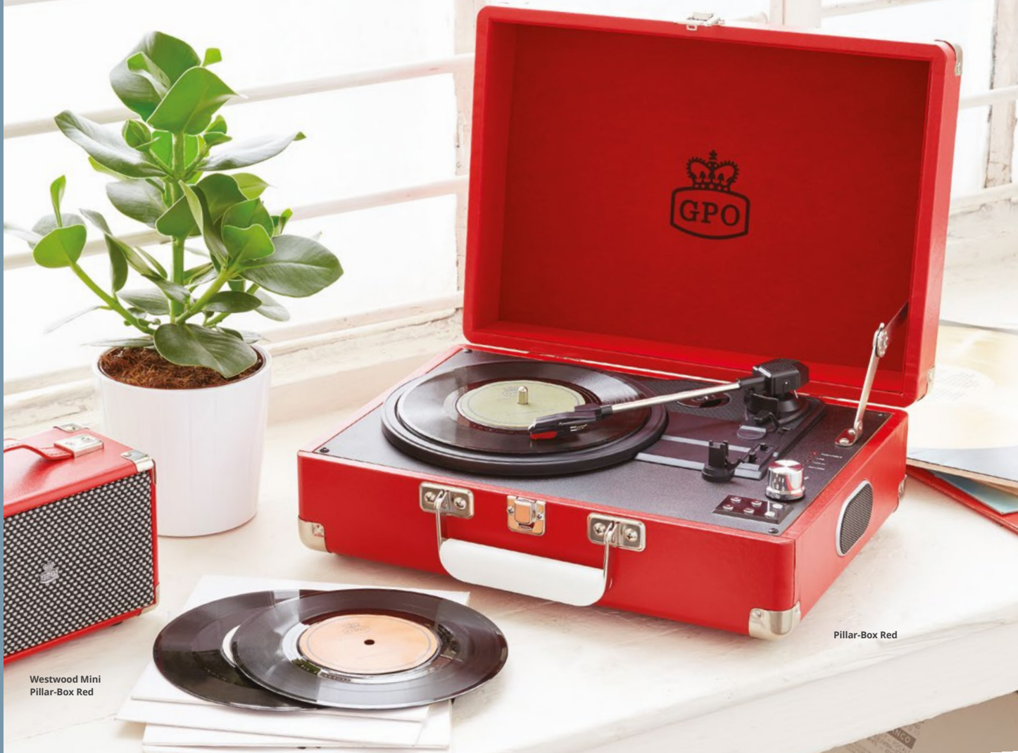
Westwood Mini Pillar-Box Red