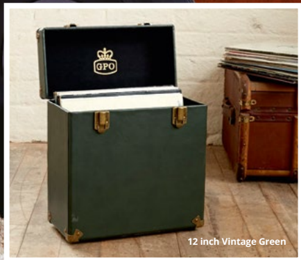
12 inch Vintage Green