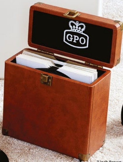
7 inch Brown