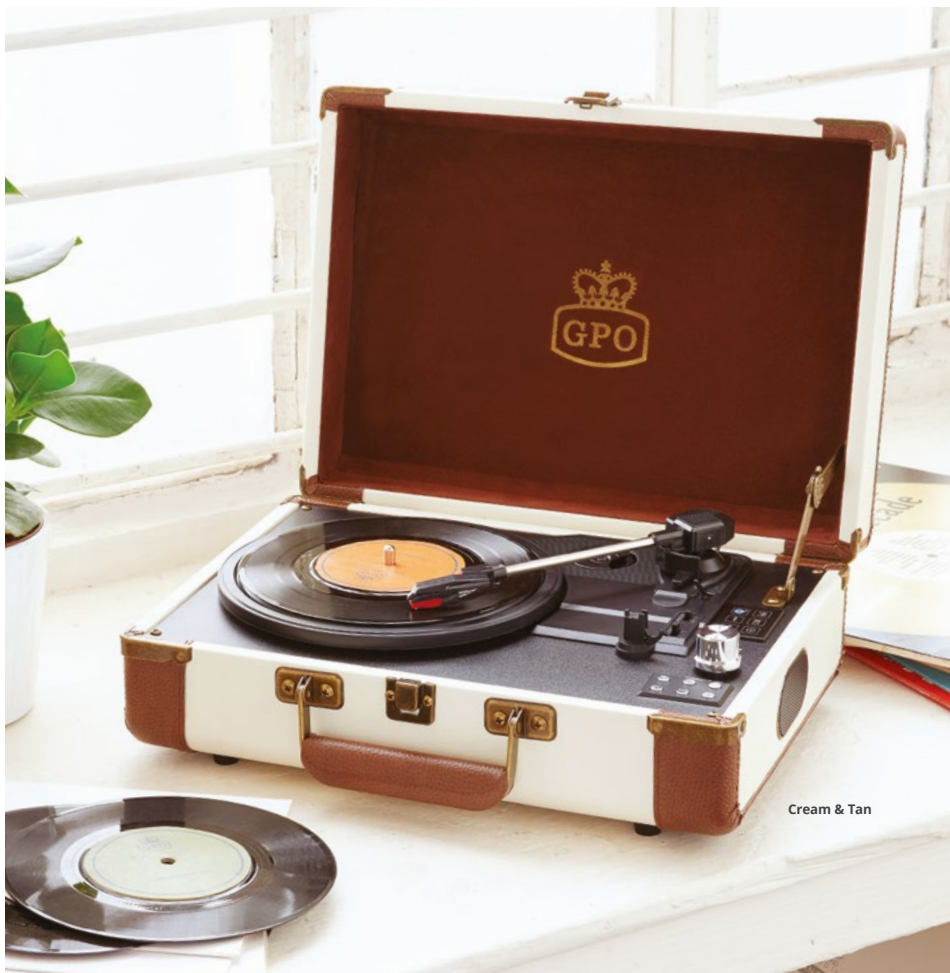
Cream & Tan