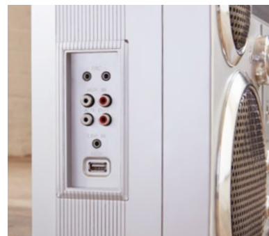
Black & Silver/Chrome