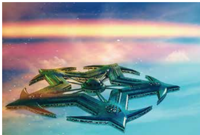
UHD Series Display

Superior SMDS guarantee high contrast and provide a clearer, brighter picture.